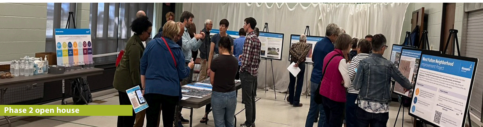
Phase 2 open house

Community members expressed a desire to see improved stormwater sewer management and drainage, particularly following heavy rainfall and snow melts.