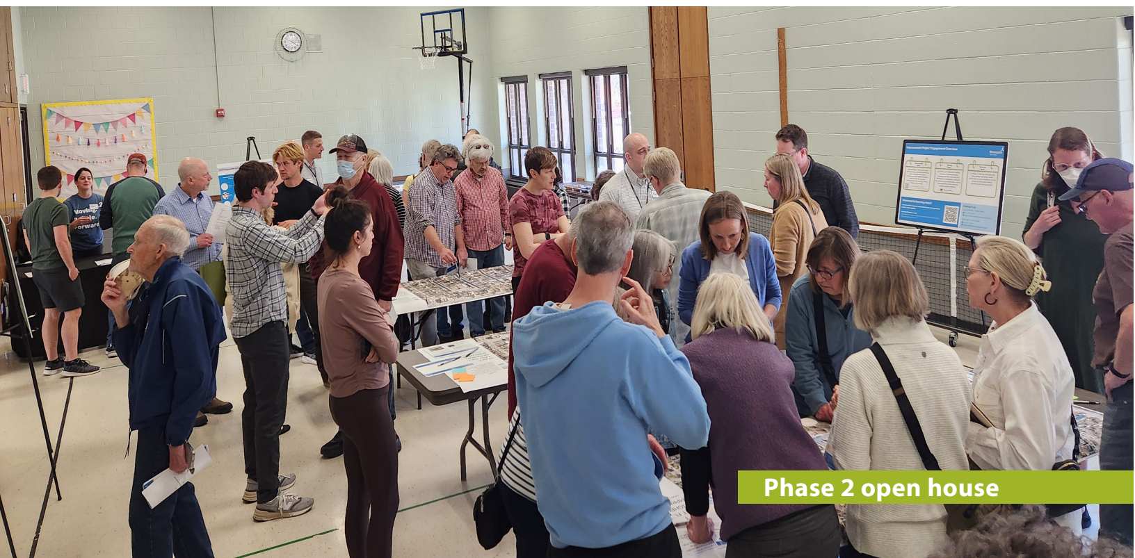
Phase 2 open house