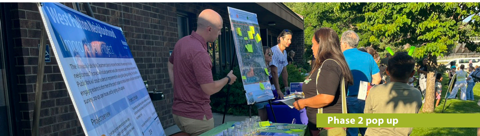
Phase 2 pop up