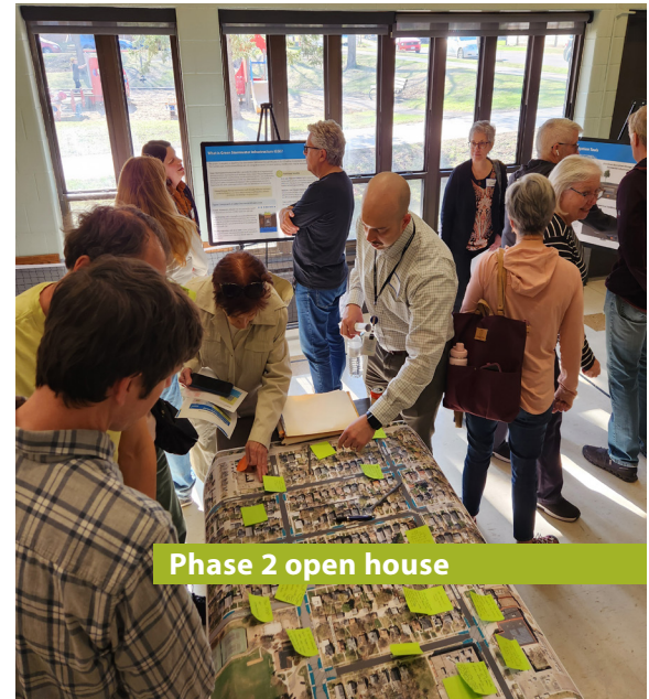
Phase 2 open house