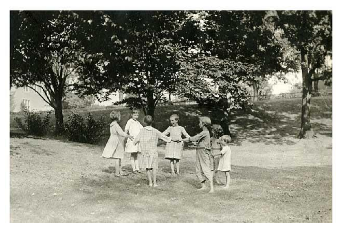
Figure 5. "Girls playing at Fair Oaks Park," 1925.

The demolition of large mansions on multi-acre sites would continue through the 1930s. In 1935 the Clinton Morrison mansion at 305 East 24<sup>th</sup> Street was razed and the Fair Oaks Apartments, which were completed in 1939, were constructed in its place.