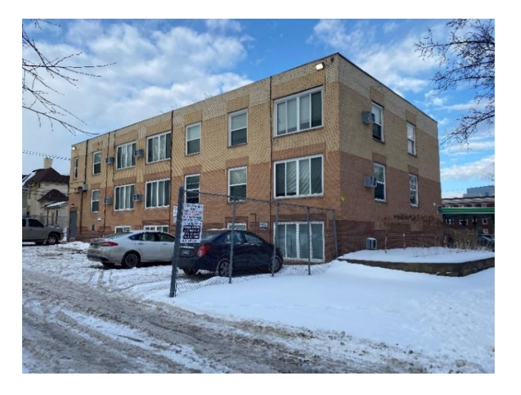
Figure 9. Mid-Century Apartment Building at 2014 3<sup>rd</sup> Avenue South.