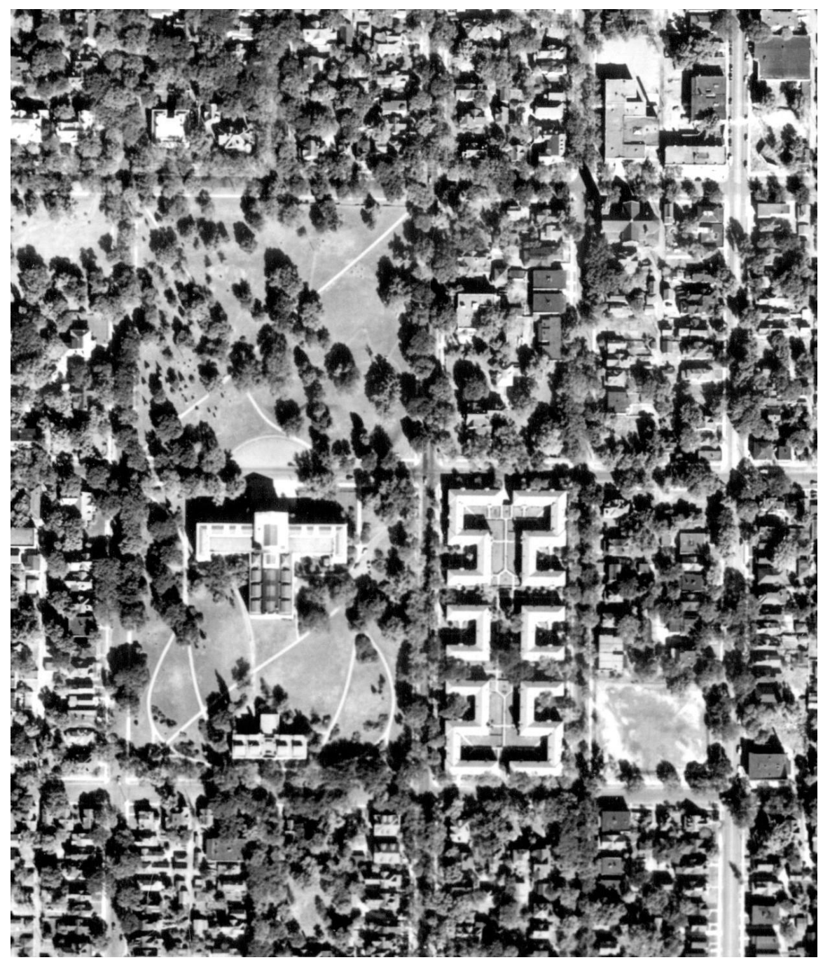
Figure 10. The area now known as the Washburn Fair Oaks Historic District, c. 1945.

Based on existing documentation, Pigeon Consulting finds that the Period of Significance for the Washburn-Fair Oaks Historic District is 1863 to 1939 . These dates mark the construction date of the oldest extant building in the district and the construction of the Fair Oaks Apartments.