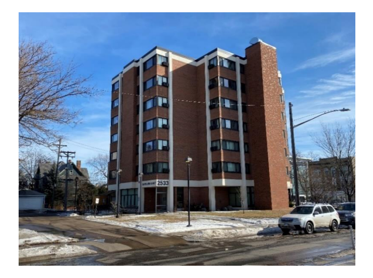
Figure 8. Public Housing Development at 2533 1st Avenue South.

Post-war buildings within the District also represented the changing demographics of the neighborhood, as many of the larger houses were subdivided into apartment or condominium units, and low-income and public housing options were introduced to the neighborhood (including the senior living apartments constructed by the Minneapolis Public Housing Authority in 1965 at 2533 1<sup>st</sup> Avenue South pictured in Figure 8 below, and the condominium units constructed by Project for Pride in Living in 1983 at 2214-2218 4<sup>th</sup> Avenue South).