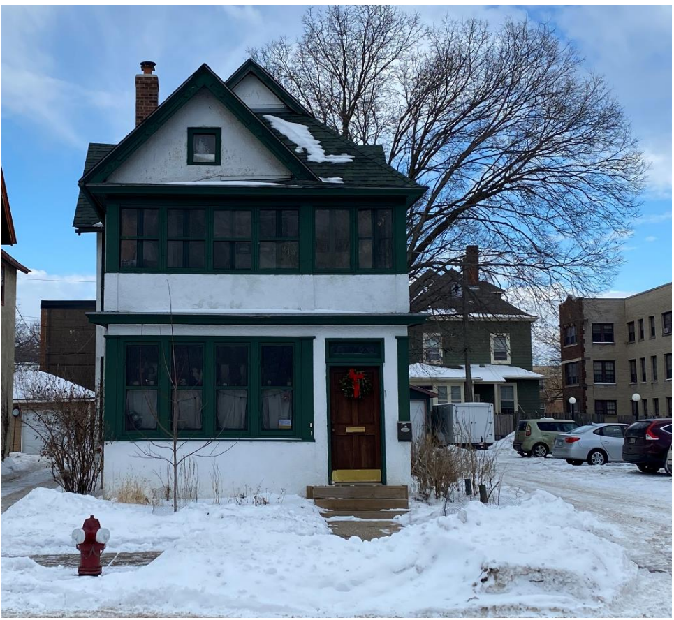
Figure 3. 2030 Clinton Avenue.

From the 1870s through 1922, facilitated by the expansion of the streetcar system, large architect-designed single-family homes, multi-family apartment buildings, and religious institutions were constructed in the area that would become the Washburn Fair Oaks Historic District.<sup>7</sup> In 1910, Villa Rosa was demolished and between 1913 and 1915, the McKim, Mead & White-designed Minneapolis Institute of Art was constructed on the site.