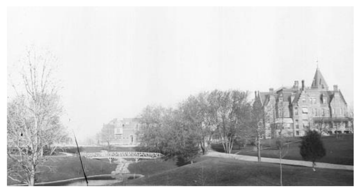
Figure 4. W.D. Washburn's "Fair Oaks," date unknown.