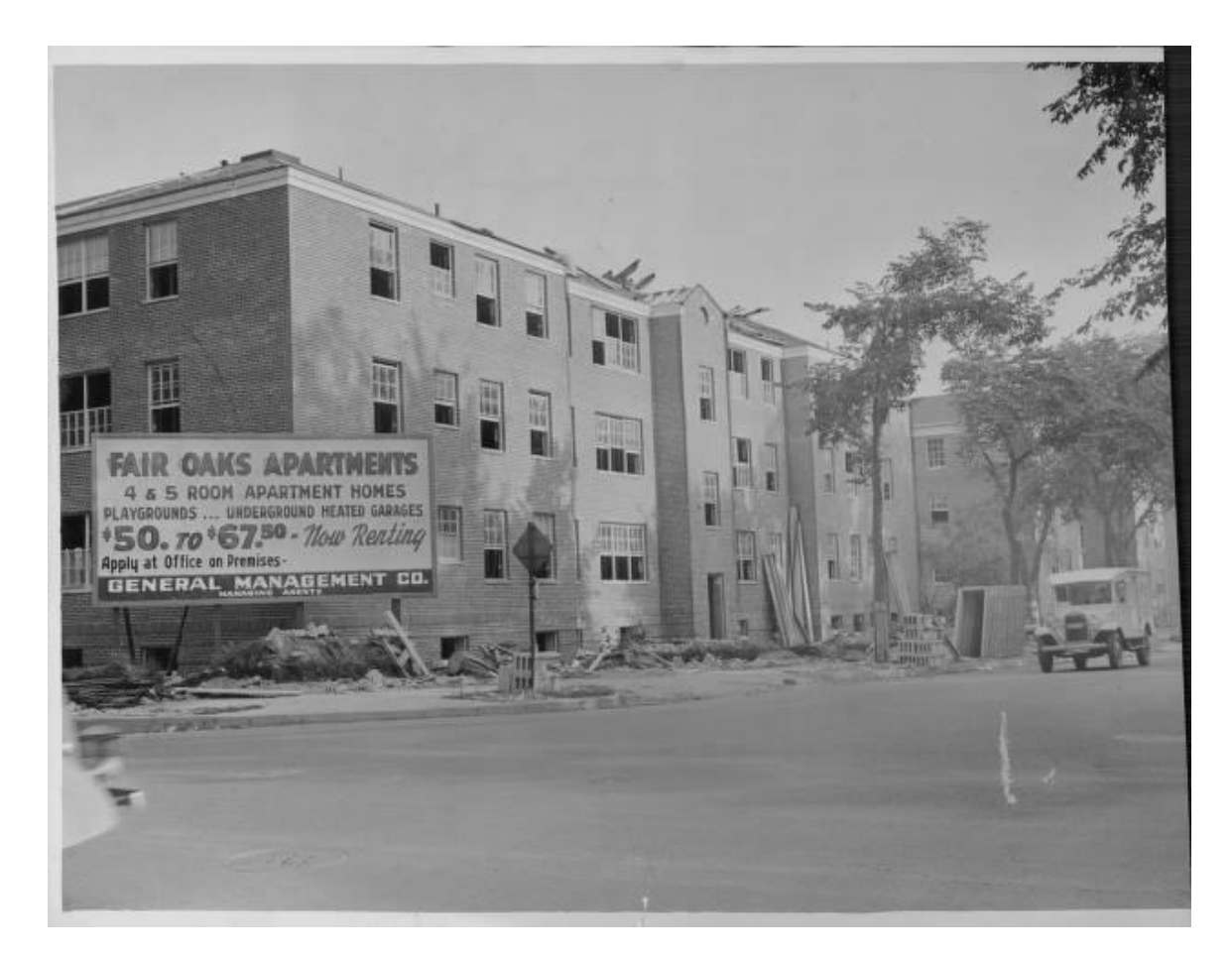
Figure 6. Fair Oaks Apartments Nearing Completion, 1939.

Designed by Perry Croiser, the Fair Oaks Apartments were designed to create private interior courtyards for the 224 apartment units. The apartments were considered "quite posh...[with] garage attendants [who] would wash and service your car...and maid service."<sup>9</sup> The emphasis on manicured exterior space and a "posh" lifestyle associated with the Fair Oaks Apartments built upon the garden-like setting and association with affluence of the existing neighborhood. While the creation of Washburn-Fair Oaks Park, the construction of the Minneapolis Institute of Arts, and the construction of the Fair Oaks Apartments all required the demolition of large mansions that were situated on multiple acre sites, the replacement properties were intentionally designed to maintain the majestic scale of the large homes and sites, which played an integral part in sustaining the sense of grandeur for which the neighborhood had become known.