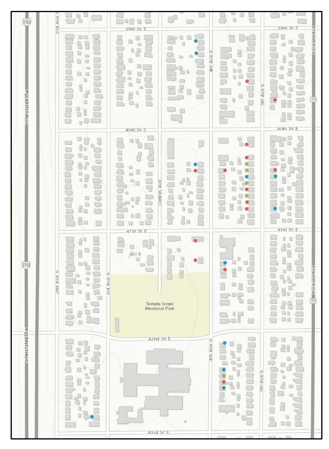
Northern half of the Tilsenbilt Homes Historic District. Contributing properties shown in red, noncontributing properties shown in green, and Tilsenbilt Homes not included in the district shown in blue. CPED Staff.