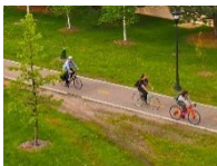
Trail connections through parks