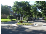
Traffic circles to calm traffic at intersections