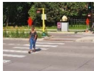
Crossing improvements added at busy intersections