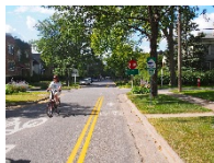
Signs and markings to help people find their way