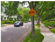
Traffic calming to keep driver speeds low