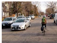
Bikes and cars share the same space