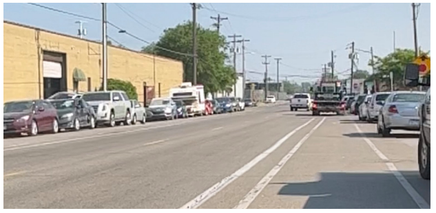
Existing Conditions- North 2nd Street

This project will build a two-way separated bikeway on 2nd Street N between Dowling Ave N to Plymouth Ave N. The protected bikeway will replace the current on-street bicycle lanes on 2nd Street N. The current on-street bicycle lanes do not provide enough protection from vehicle traffic. At signalized intersections, this project will add protected intersection design elements. This project will connect to a new two-way bikeway from a separate reconstruction project at the intersection of Dowling and 2nd Street N. It will also connect to new trails to and through the under-development Upper Harbor Regional Park and other protected bikeway projects.