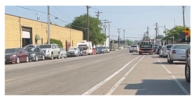
Existing Conditions- North 2nd Street

This project will build a two-way separated bikeway on 2nd Street N between Dowling Ave N to Plymouth Ave N. The protected bikeway will replace the current on-street bicycle lanes on 2nd Street N. The current on-street bicycle lanes do not provide enough protection from vehicle traffic. At signalized intersections, this project will add protected intersection design elements. This project will connect to a new two-way bikeway from a separate reconstruction project at the intersection of Dowling and 2nd Street N. It will also connect to new trails to and through the under-development Upper Harbor Regional Park and other protected bikeway projects.