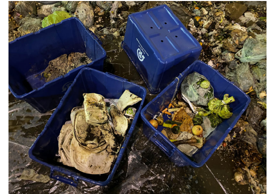
Breakdown of Contamination Trends (2017-2024)