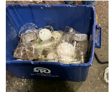
Compostable plastics (68% BPI certified)