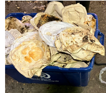
Molded food-service packaging (60% BPI certified)