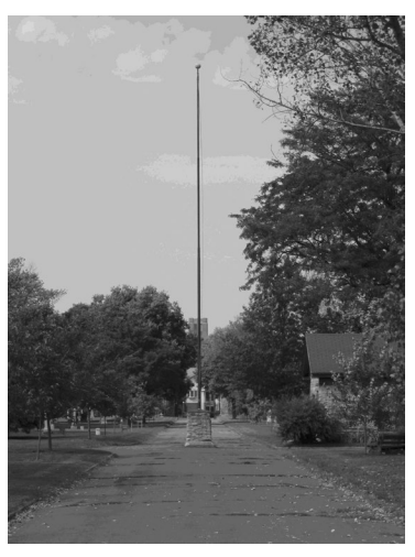
Flagpole, looking east