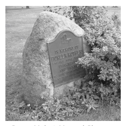
Pioneer Mother's Memorial, August 2005