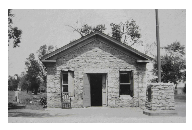
Cemetery off ice building looking north, Photo by anonymous, circa 1930

The cemetery contains two contributing buildings: an office building and a shed. The cemetery office building was built in 1871, and is located in the middle of the cemetery, north of the flagpole and the driveway. The one-story, gable-roof building is constructed of rough-cut limestone blocks and is oriented in a north-south direction. The roof is covered with asphalt shingles. Cornice returns on the north and south sides of the building give it a modest Greek Revival appearance. A wood and glass