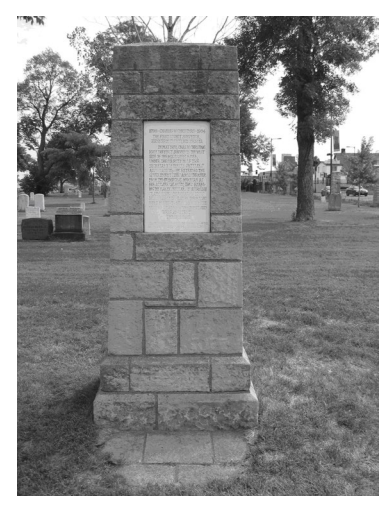
Charles W. Christmas grave marker, looking east, Photo by Jeff Adams, August 2005

The majority of markers in Layman's Cemetery are late nineteenth and early twentieth century in date, in a variety of forms and styles, and in widely varied states of repair. They are made of marble, sandstone, granite, iron, and