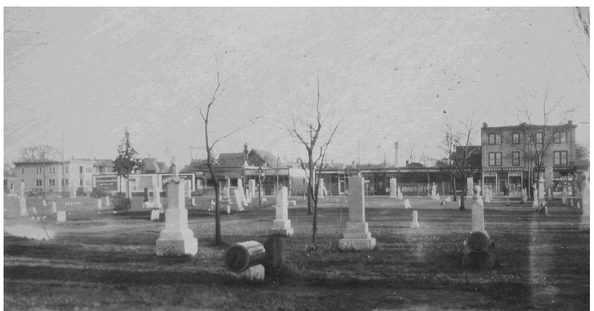
Cemetery grounds from driveway, looking southeast, Photo by Anonymous, circa 1930

In order to identify those features that have cultural, historical, architectural, and/or artistic significance, it is first important to understand the history and development of the cemetery. The following sections provide a summary of the historical development of Pioneers and Soldiers Cemetery and lists the features that contribute to the cemetery's historical significance. The features listed are what the Heritage Preservation Commission (HPC) seeks to protect in order to preserve the site's integrity. Without integrity, a historic site is no longer able to convey its meaning, significance, and historical connections.