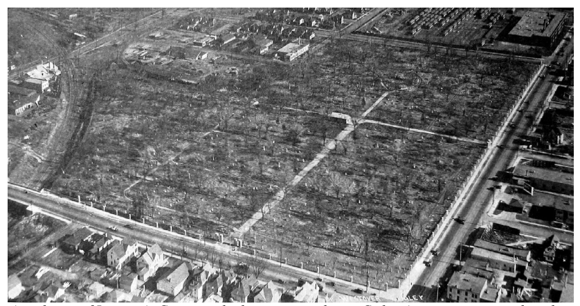
Aerial view of Layman's Cemetery, looking east-northeast, Cedar Avenue runs vertical on the right and Lake Street horizontal in the foreground, circa 1930

Pioneers and Soldiers Cemetery exhibits the pattern of the natural terrain. The grass-covered terrain of the cemetery site is relatively flat; however, it slopes downward in the northeast section toward Twenty-First Avenue South and slopes upward in the northwest section toward Cedar Avenue (Registration Form, 2006)..