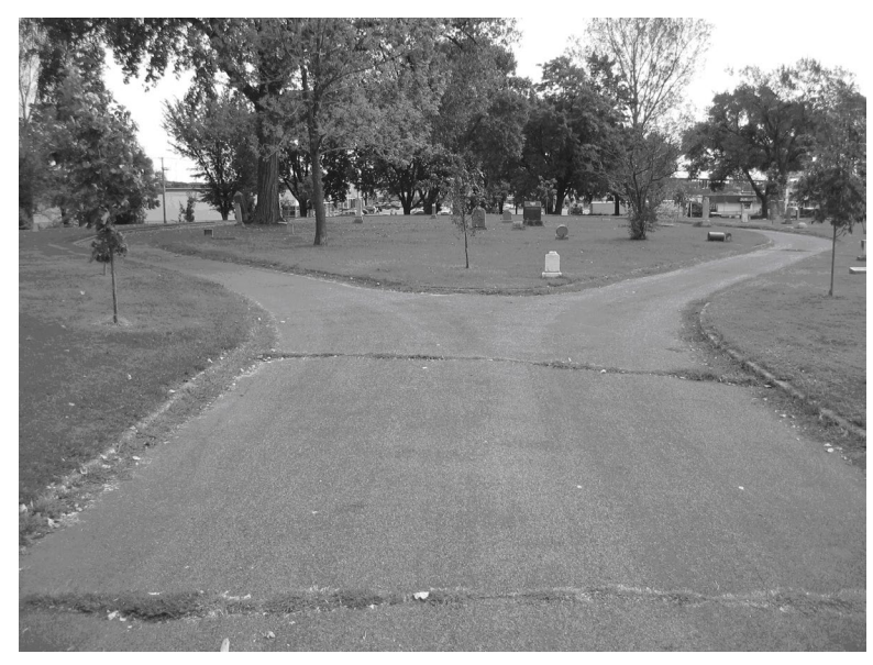
Turnaround circle, looking west, Photo by Jeff Adams, August 2005

A paved asphalt driveway extends from the Cedar Avenue gate to the cemetery office building, this was known as Elizabeth Street, after Martin Layman's wife. The turnaround circle is located approximately two-thirds of the way across the cemetery. The contributing driveway and turnaround circle, even though resurfaced and somewhat altered in configuration, are among the oldest surviving features of the site. These features predate the reworking of the