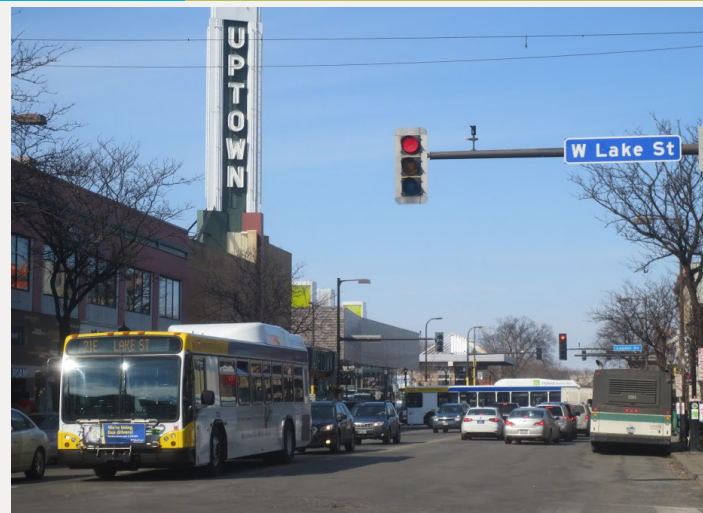
Hennepin Avenue South looking north at W Lake Street

For reasonable accommodations or alternative formats please contact Becca Hughes, Minneapolis Public Works Department at 612-673-5012 or Rebecca.Hughes@minneapolismn.gov. People who are deaf or hard of hearing can use a relay service to call 311 at 612-673-3000. TTY users call 612-673-2157. Para asistencia 612-673-2700 - Rau kev pab 612-673-2800 - Hadii aad Caawimaad u baahantahay 612-673-3500.