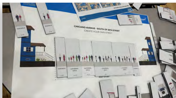
Sample street puzzle

The street puzzle activity was used to gather input from community on their ideas for a street layout. People chose from a variety of street elements such as bike lanes, sidewalks, public gathering space, and transit. They arranged these elements to layout a street that aligns with their vision and values for this area.