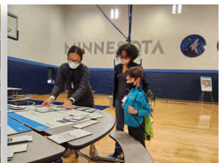
Family working on street puzzle