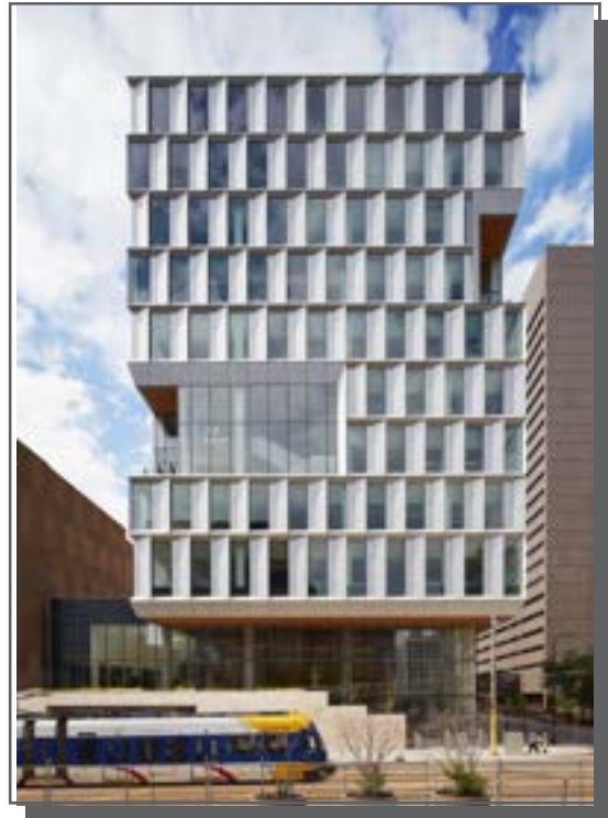
Public Service Building