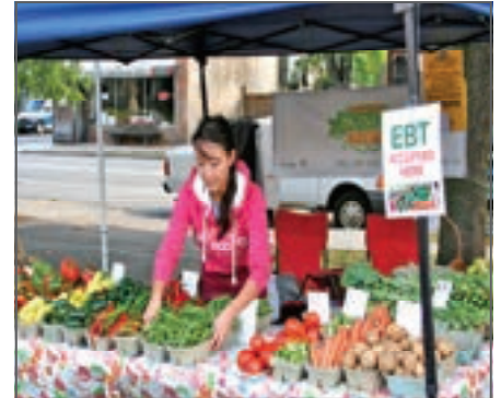
One of 50+ Farmers Markets

Downtown Minneapolis is the core of the city's strong economy. A mecca of skyscrapers, theaters, shopping, dining and historic districts, Downtown also offers some of the nation's finest department stores and shops.