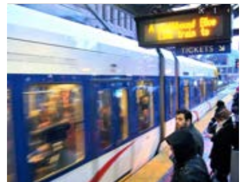
Light Rail Blue Line at City Hall

The City of Minneapolis, often called the City of Lakes, provides breathtaking natural beauty with its 22 lakes and the Mississippi River winding through the landscape. Its 170 parks and 166 miles of on- and off-street bike paths help to blend the best of urban life with family oriented residential neighborhoods.