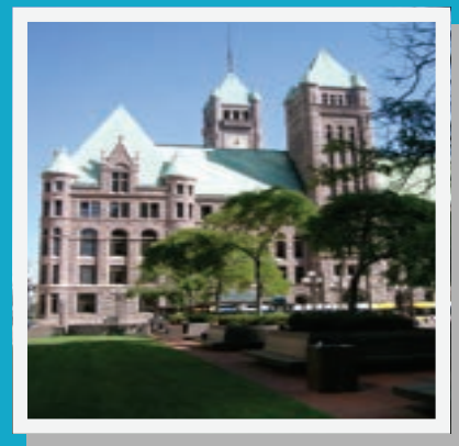
Minneapolis City Hall

There are 10 Charter departments within the City of Minneapolis. The Public Works Department is the largest.