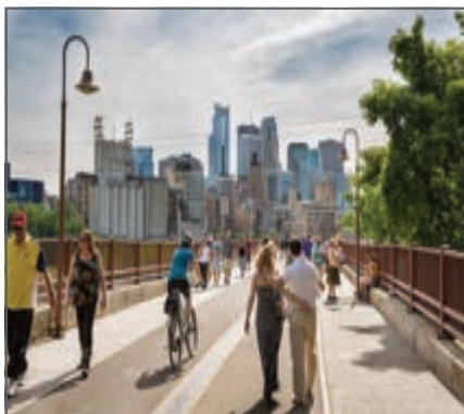
Stone Arch Bike/Pedestrian Bridge

The Twin Cities metropolitan area provides a vast array of