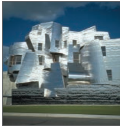
Weisman Art Museum

entertainment opportunities, including the Mall of America, the Minnesota United, and the Minnesota Wild hockey team. Minneapolis proper is home to the Minnesota Twins, Minnesota Vikings, the Minnesota Lynx and the Minnesota Timberwolves.