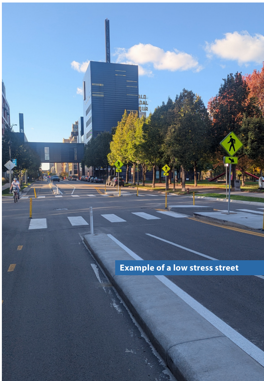
Example of a low stress street