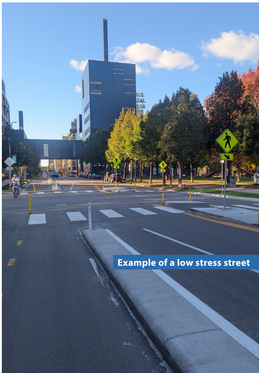
Example of a low stress street