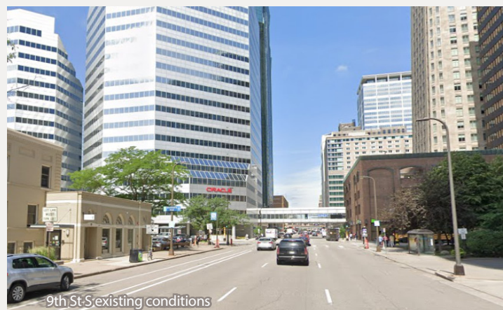
9th St S existing conditions

Source: Minneapolis Bicycle & Pedestrian Counts (2013-2018) and Minneapolis Public Works (2010-2014)