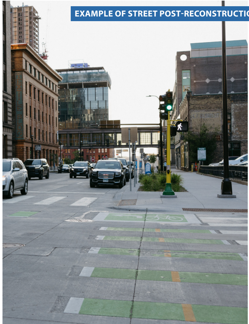
EXAMPLE OF STREET POST-RECONSTRUCTION