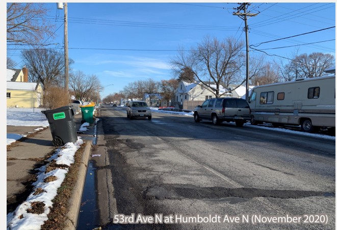
53rd Ave N at Humboldt Ave N (November 2020)