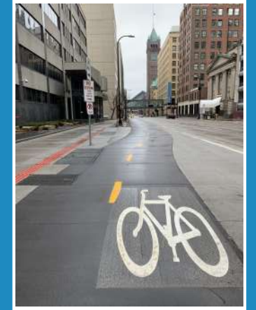
Two-way bike lane