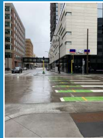
Improved crossings at intersections