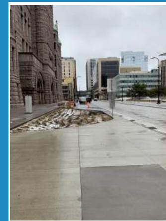
Wider sidewalks and rain gardens