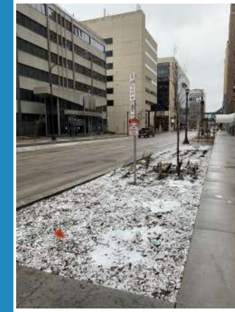
Landscaped planting beds and new trees