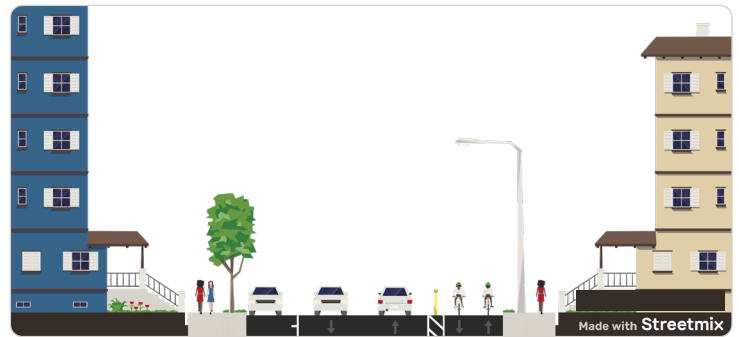
Figure 1: Existing 40th St configuration with flex post separated bikeway