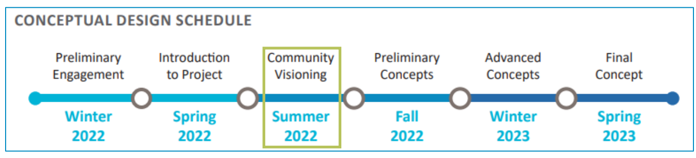
Figure 7: Conceptual Design Schedule