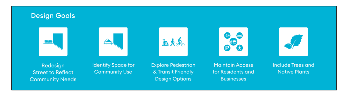
Figure 3: Design Goals