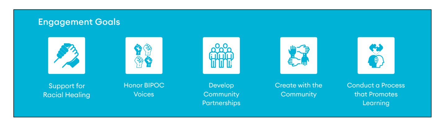
Figure 2: Engagement Goals

The overall goals and objectives of the project are included below and contain design and engagement goals.