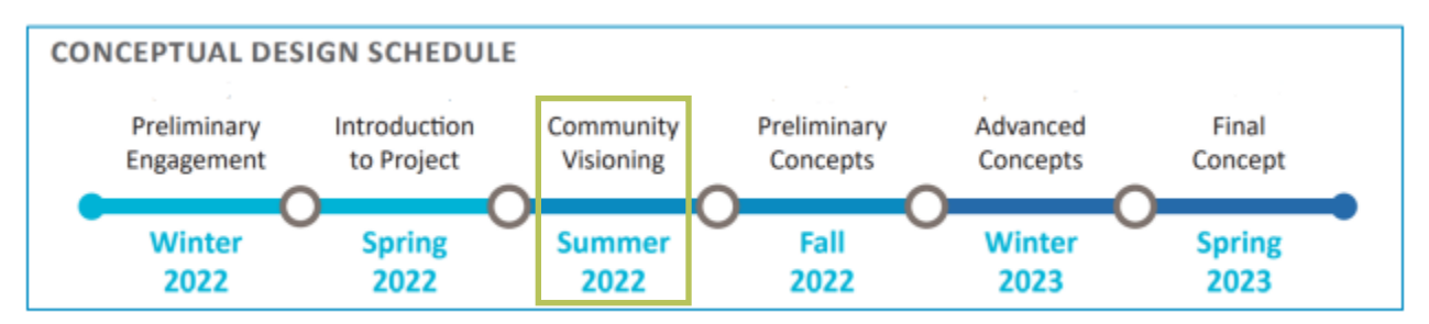
Figure 1: Conceptual Design Schedule