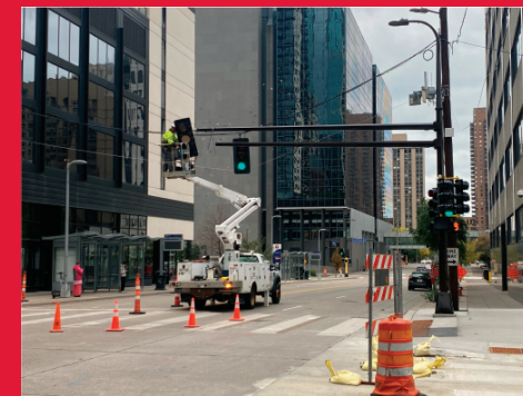
Hanging signal heads at Marquette Ave