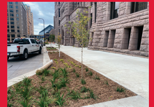
Planter beds and rain garden installation in front of city hall