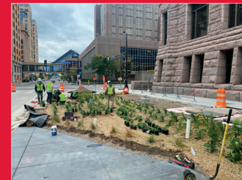
Planter beds and rain garden installation in front of city hall