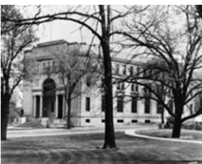
Northwestern National Life Insurance Building