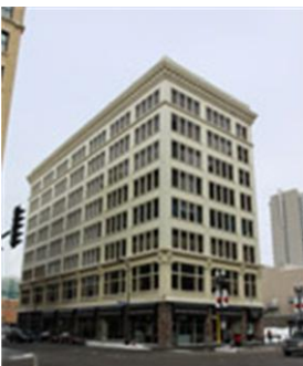
Lincoln Bank Building