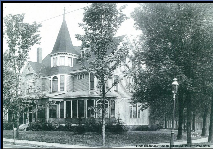
Viehman Residence 2006 Laurel Avenue West Construction: 1888 • Local Designation: January 13, 2012

Minneapolis Heritage Preservation Commission