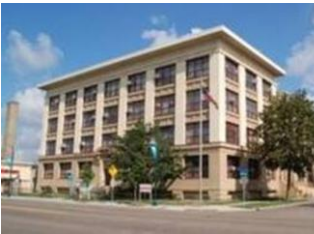
Buzza Co. Building