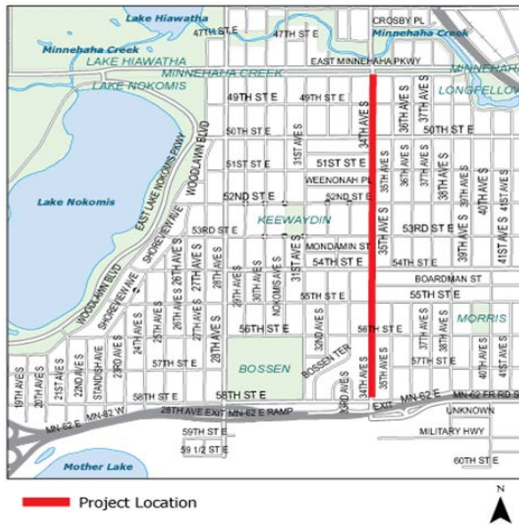
34th Ave S Reconstruction