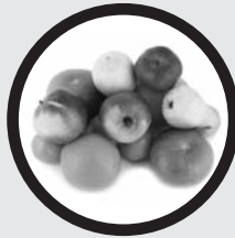
Eat fruit as your snack