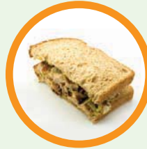
Eat smaller portions