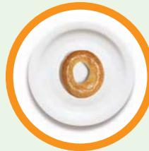
Order the smaller size