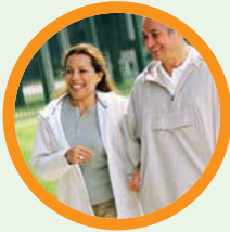
Walk briskly every day