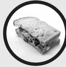
Eat smaller portions