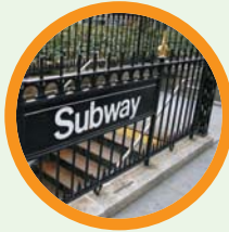
Get off the subway or bus one stop early