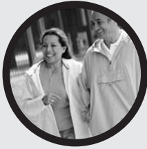
Walk briskly every day