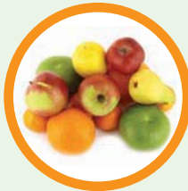
Eat fruit as your snack