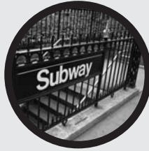
Get off the subway or bus one stop early