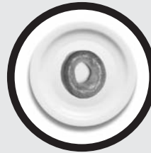
Order the smaller size