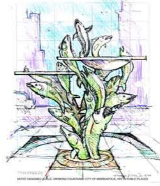
Concept Drawing of Option Drinking Fountain