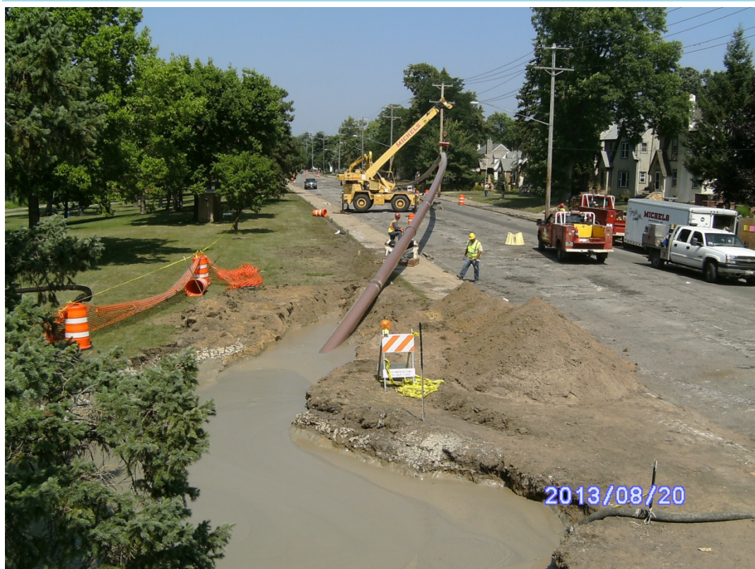
CenterPoint crews installing a gas main that runs 60 feet below the creek.

Both meetings will be held from 6:00-8:00 pm at Minnehaha Communion Lutheran Church, 4101 37 th Avenue. Hennepin County and City of Minneapolis Public Works staff will provide information about the project, which is scheduled to begin during the spring of 2015.